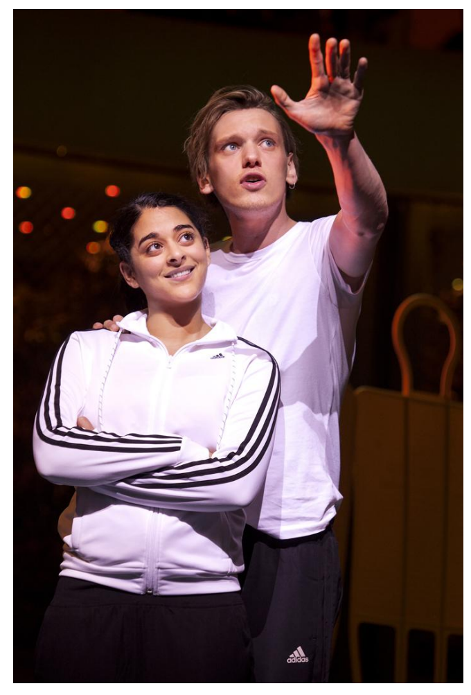
Bend It Like Beckham The Musical review

The sets are fabulous, ranging from the Indian stalls in Southall market, to a German nightclub and even the departure lounge at Heathrow airport, all seamlessly changed with revolving panels and platforms.